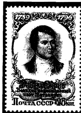
A Russian postage stamp honoring Robert Burns

On fame's emblazon'd page enshrined, his name is foremost now. And many a costly wreath's been twined, to grace his honest brow. And Scotland's heart expands wi' joy, whene'er the day returns. That gave the world it's peasant boy, IMMORTAL RABBIE BURNS.